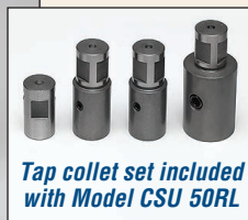
Tap collet set included with Model CSU 50RL

Standard Equipment includes auto lubrication, auto chuck cutter holder, manual chuck with set screws, geared chuck, safety chain, carabin hook, allen keys, pilot pins and carrying case. (CSU 50RL shown)