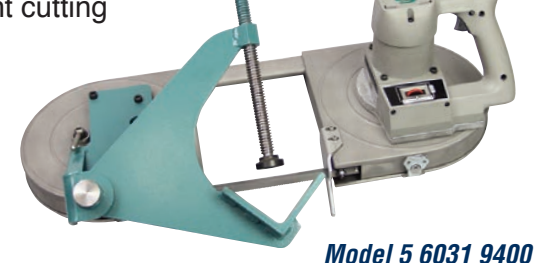
with Band Saw

Clamp-on vise for 7" Deep Throat™ Band Saws (model numbers 5 6031 0010, 5 6040 0010 and 5 6041 0010) Maximum material size - rounds: 7"; squares: 5"; angles: 5"